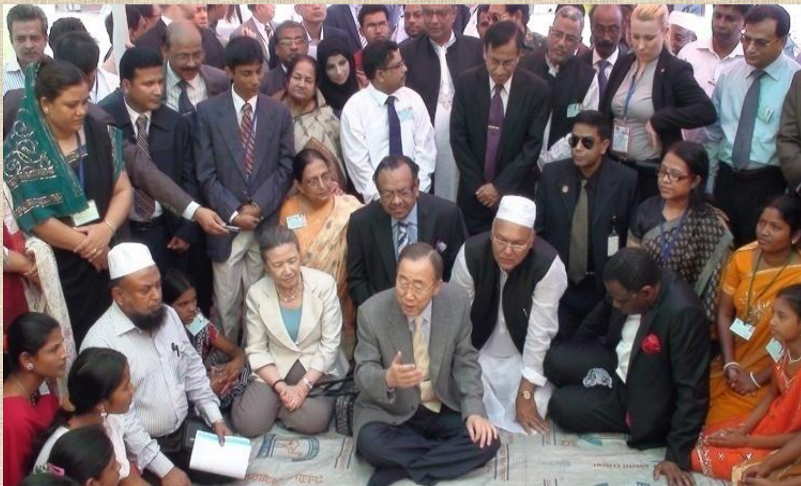
H.E. Honorable Secretary General of UNO Mr. Ban Ki-moon talking with adolescent girls at the premises of Mobarokpur Community Clinic under Kulaura Upazila of Moulvibazar District on 16/11/2011.