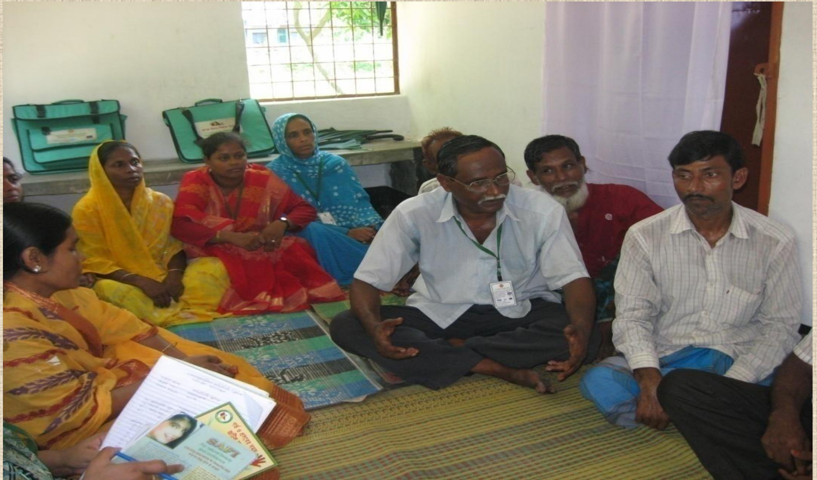
Community Group monthly meeting at CC