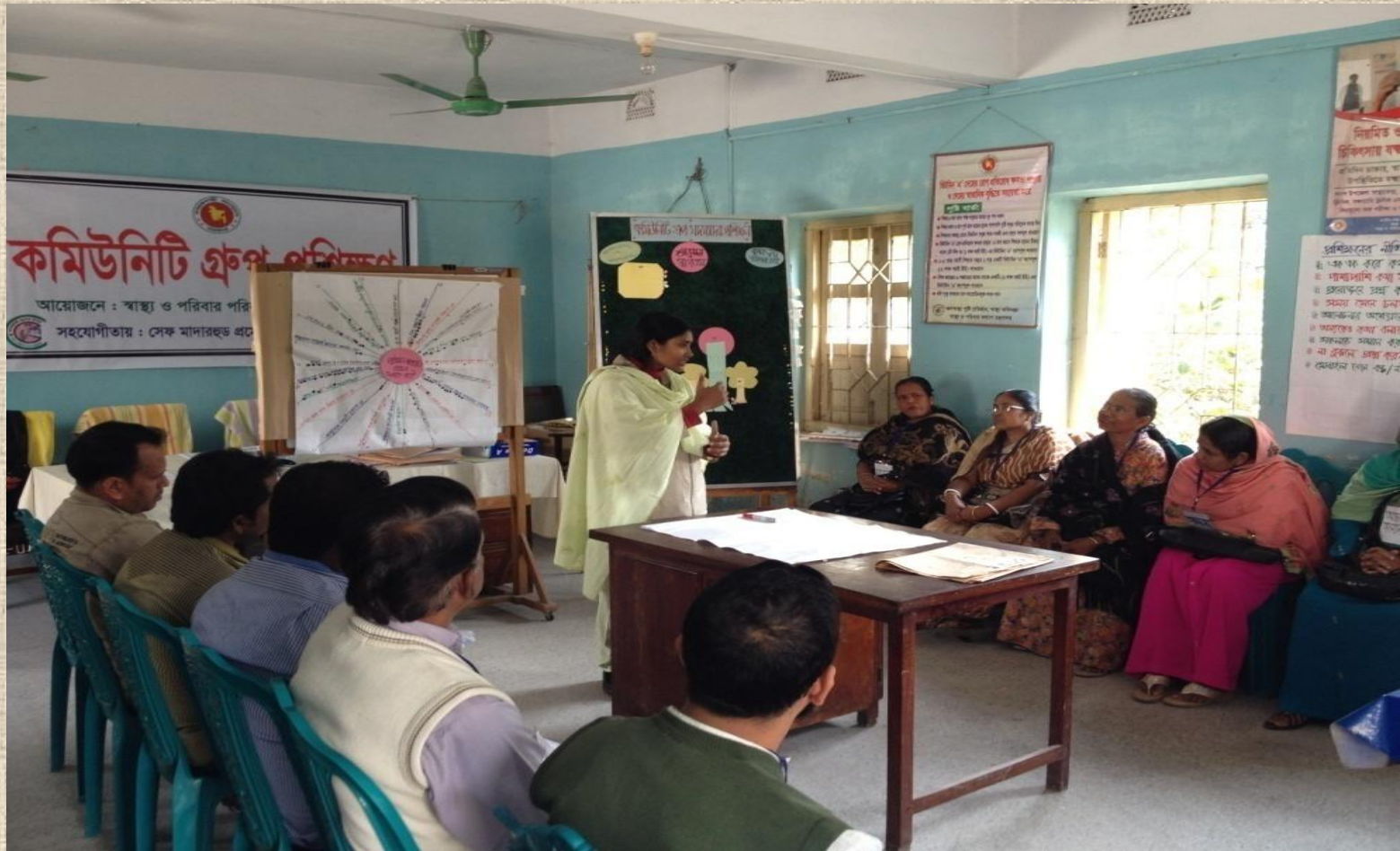
Community Group Training